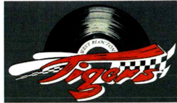
Front - Small design on Left chest or pocket area