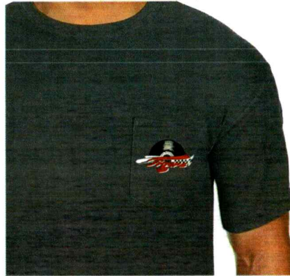
FRONT - Shown on T-Shirt with POCKET

Comfort Wash Dark Gray Shirt with multiple color art and text. PICK YOUR SHIRT STYLE!