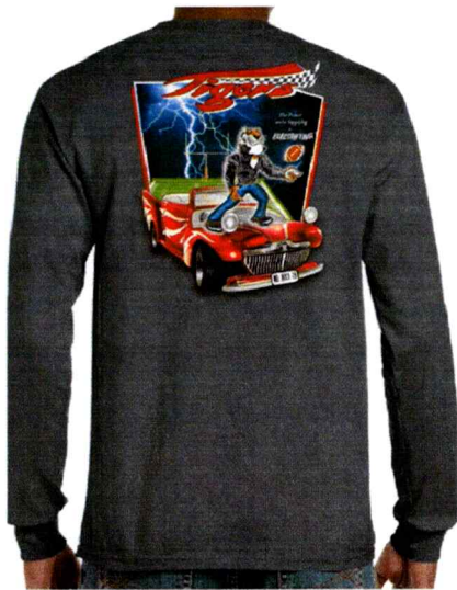
BACK- Shown on Long Sleeve T-Shirt

$17.00 for Youth sizes and Adult Small - XL $19.00 for Adult 2XL - 4XL