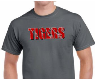
Short Sleeve shown with FRONT design

* COMFORT COLOR LONG SLEEVE T-SHIRT HOODIE Color = Pepper $25.00 for Adult Small - XL (Youth Not Available) $27.00 for 2XL – 3XL