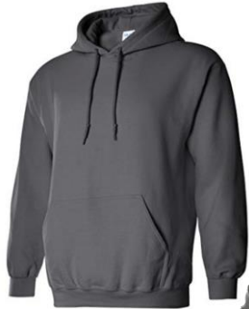
Regular Hoodie Style