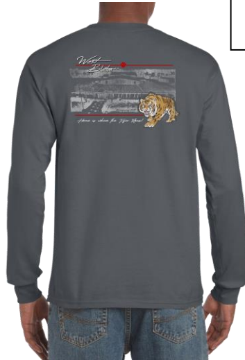
Long Sleeve shown with BACK design

Charcoal Gray Shirt with multiple color art and text. Design has picture of High School and Tiger. PICK YOUR SHIRT STYLE!