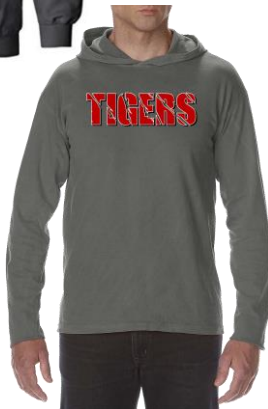
Comfort Color Long Sleeve T-Shirt Hoodie shown with FRONT design